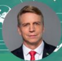
Per Bolund Minister for Environment & Climate, Deputy Prime Minister of Sweden